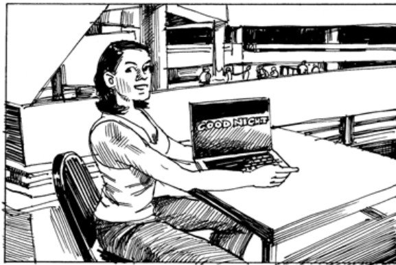
LIPDUB—I Gotta Feeling (Comm-UQAM 2009)

Because viral video is about giving your audience the unfiltered experience of being right there at your sideshow, recording the action with a single, uninterrupted shot is almost always the best way to go. David After Dentist , Leave Britney Alone! , The Sneezing Baby Panda , and Chocolate Rain are just a few examples of this. On occasion, however, a single, static camera won't capture the action. In videos like our Extreme Diet Coke & Mentos Experiments II—The Domino Effect , where we triggered 250 Coke and Mentos geysers in one big chain reaction, or OK Go's giant Rube Goldberg machine for This